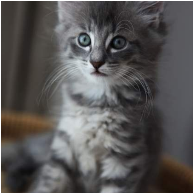
Wrapped in a <figure> element, with a <figcaption>