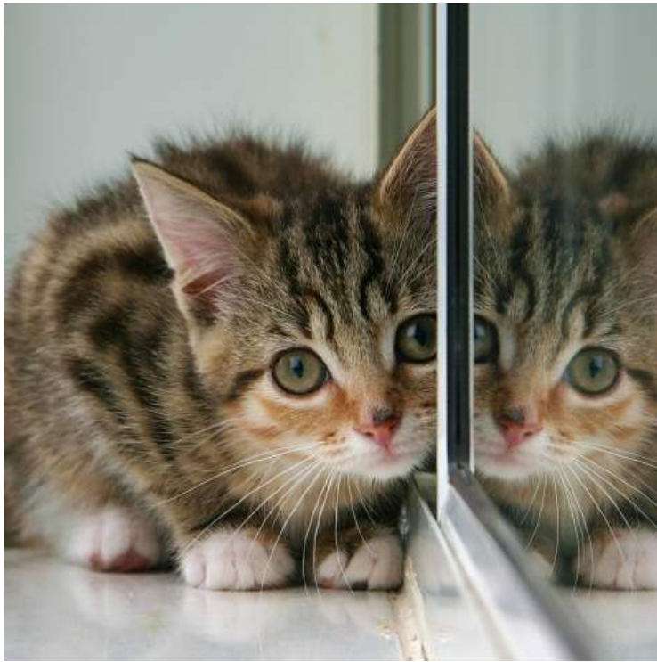
Wrapped in a <figure> element, no <figcaption>