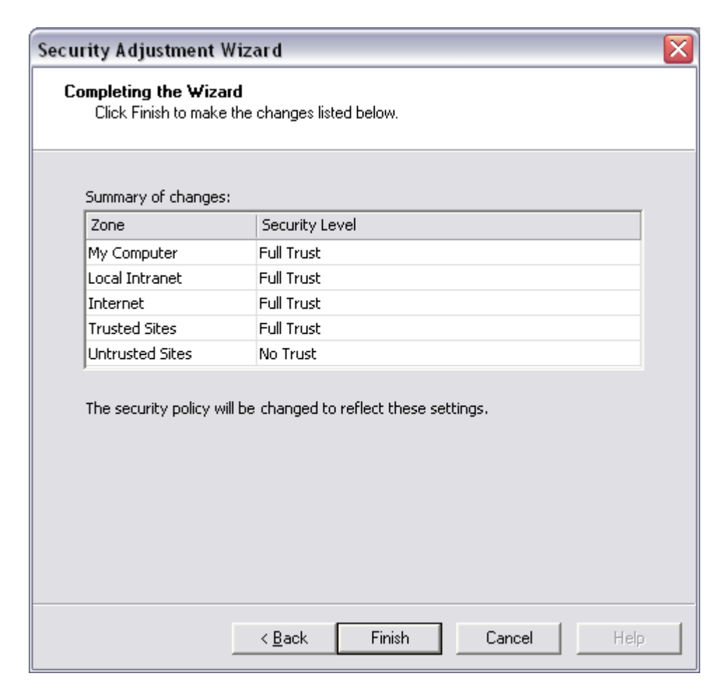
Fig.4. Security Adjustment Wizard settings summary.