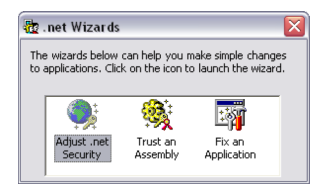
Fig.2. .NET Wizards

2) Select the Microsoft .NET Framework Wizards. This wizard contains the applications for changing the Security level to the required applications. The wizard will look like the one shown below,