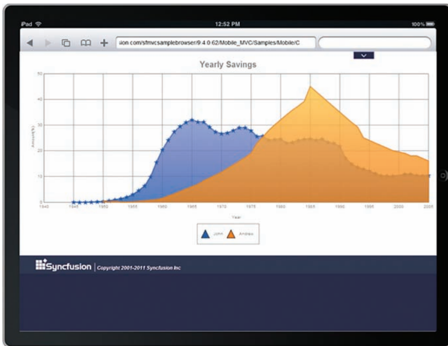
HTML 5-Enhanced Chart

Many common controls such as toolbars, menus, accordions, and dialogs are all enhanced by the advanced appearance rendering capabilities of HTML 5. For example, if you want to implement a Microsoft Office-like ribbon, you usually have to rely on server-side generated images to get the appearance of a ribbon. With HTML 5, this sort of rendering can be done purely on the client.