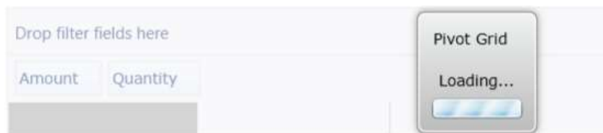
Asynchronous Loading in OLAP PivotGrid

This feature provides support for loading data in a different UI thread in the OLAP PivotGrid control. That is, the pivot grid can perform long-running operations on a background thread so that users are able to access the other UI controls when the grid is loading. The OLAP PivotGrid also loads asynchronously for every operation that changes its layout, such as filtering, sorting, and dragging as well as field list changes and pivot schema designer changes.