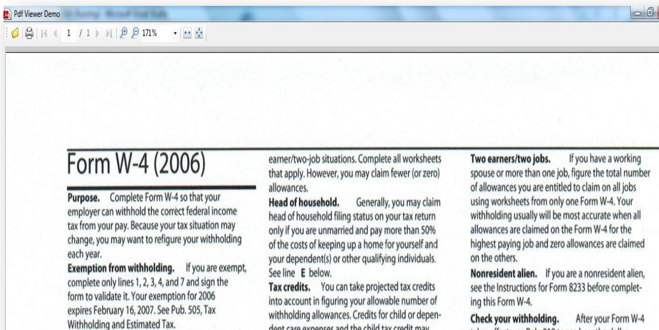
Scanned TIFF Image

The CCITTFax decode filter is used to encode and decode scanned TIFF images in a PDF document. Now Essential PDF Viewer provides support for the filter for decoding TIFF images so that users can directly view the images in a PDF document.